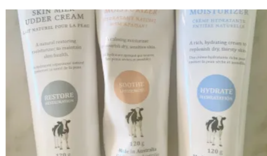
Moogoo Skincare: Australian Brand Now In Canada December 22, 2021 In "More Than Beauty"